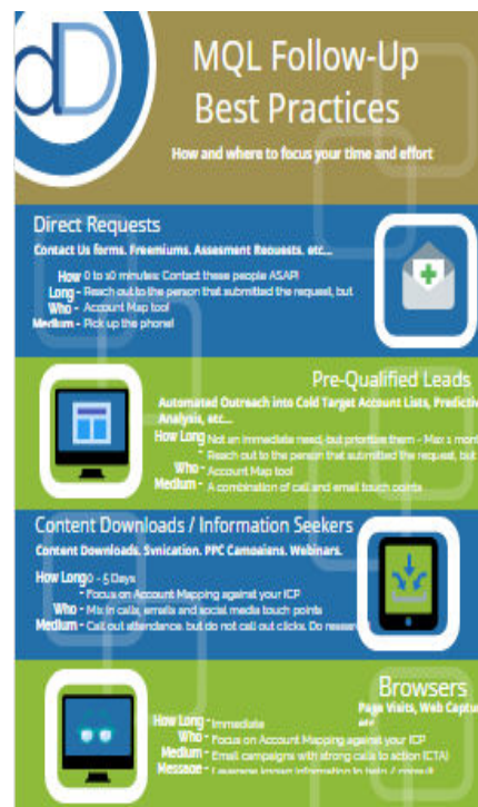
MQL Followup Infographic

The most passive form of MQL, these are prospects that happened upon your website or content and failed to engage at a high enough level. They could have no interest in learning more, but it's up to your SDRs to see if that's the case!